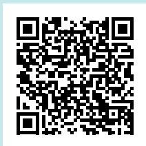
Glamorgan Spring Bay Council Website