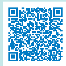
Waste Collection Calendar