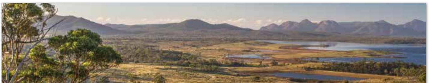
Freycinet Peninsula from Cherry Tree

Mail: Glamorgan Spring Bay Council, PO Box 6, Triabunna, Tasmania 7190