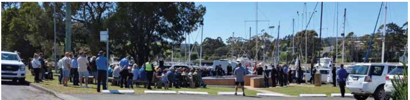
Seafarers' Memorial Service, Triabunna