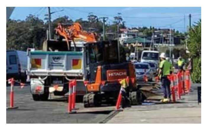
Other kerb replacement integrated with the reseal and pavement program.

Funds previously spent on urban nature-strips were this year diverted into a capital allocation for renewal of failing and problematic footpaths and kerbs. The photo below shows 2 of 8 kerb ramps replaced and construction underway on improving the disabled parking at the supermarket in conjunction with kerb replacement ahead of resealing.