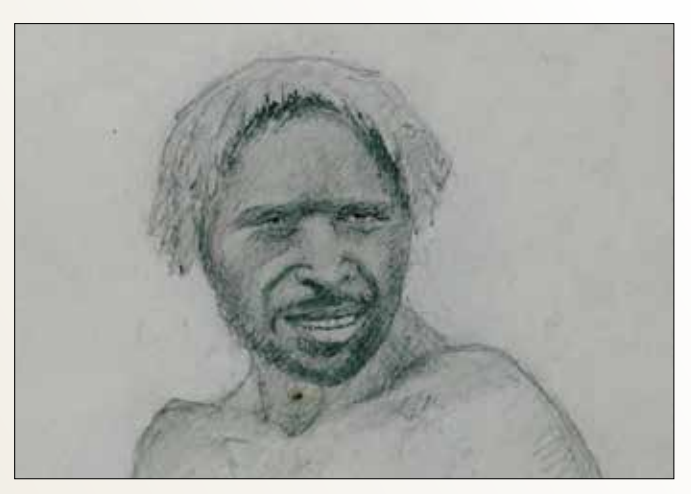
Sketch of Tongerlongeter by Thomas Bock 1832 (Queen Victoria Museum and Art Gallery)

Most colonists were unprepared to face real conflict. They were at a loss when convicts refused to work alone, or unarmed. The government seemed powerless to suppress the growing hostilities but supported a military outpost at Waterloo Point, Swansea in 1827, to protect the town from escaped convicts, bush rangers and the warriors from Oyster Bay Nation.