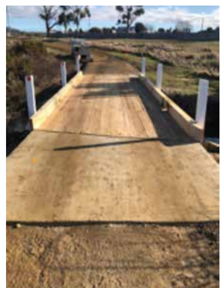
Rosedale Road bridge before and after