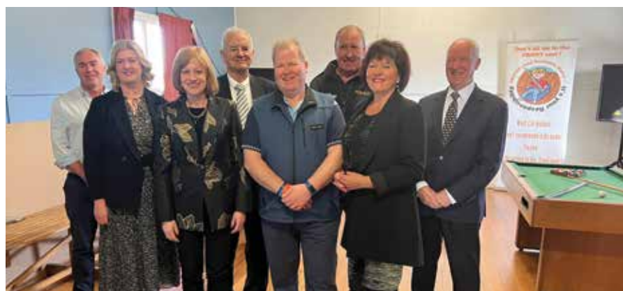
From top: Swansea Primary School, May Shaw Health Centre, Swansea PCYC