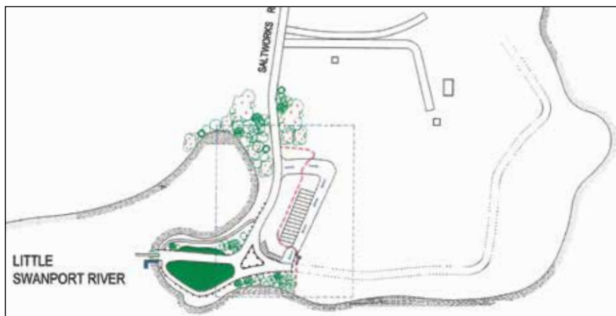
Saltworks boat ramp plan

Funding has been provided to Council by Marina and Safety Tasmania to fund a new jetty adjacent to the Saltworks boat ramp. This Jetty is currently subject to Planning permission.