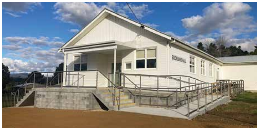
Coles Bay Community Hall

The new entrance to the Buckland Hall is complete. The new entrance includes a disability access ramp. These works were funded by the Local Roads and Community Infrastructure grant Phase 1 and the Drought Communities Grant Funding Round 2.