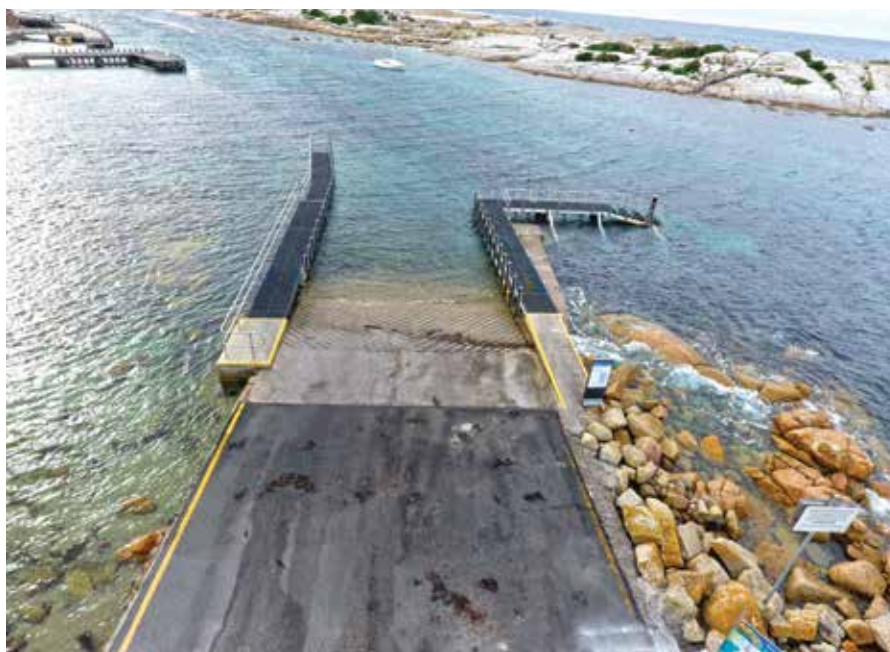
Bicheno boat ramp

These jetty extensions were fully funded by Marine and Safety Tasmania. The new extensions to both jetties at the ramp will help alleviate congestion on busy days.