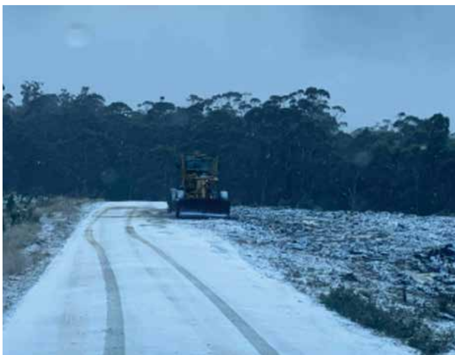
A light covering of snow on Nugent Road in July is an indicator of the weather extremes our infrastructure and staff contend with through the colder months