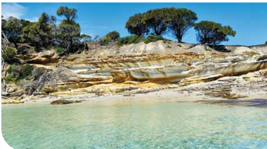
Top photo: Jubilee Beach, Swansea. Above: Maria Island