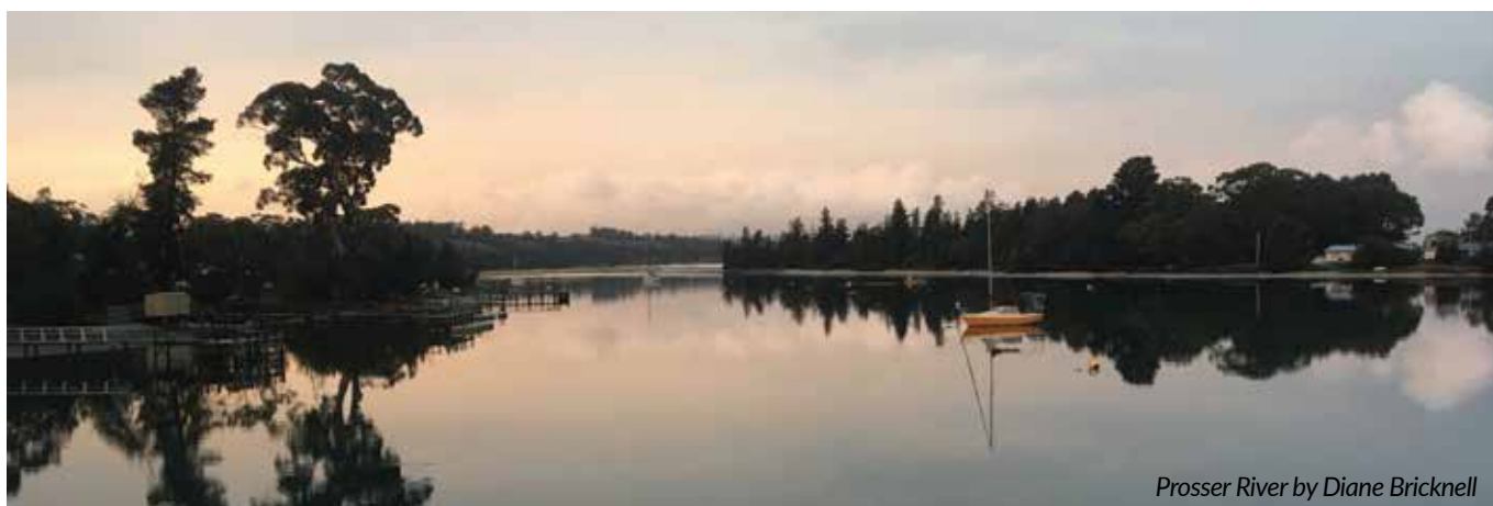
Prosser River