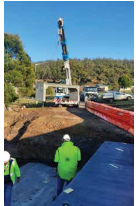
Holkham Court culvert upgrade

Here's a few fun facts. Did you know that the Highest annual Rainfall for a year in Bicheno is 1240 mm and it was recorded in 1934. The lowest rainfall year for Bicheno was 224mm in 1918. That makes 5.5 times the difference between lowest and highest rainfalls.