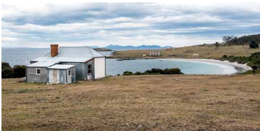
Maria Island National Park – a great place to visit!

*Open all public holidays except Christmas Day & Good Friday – Normal operating hours apply.