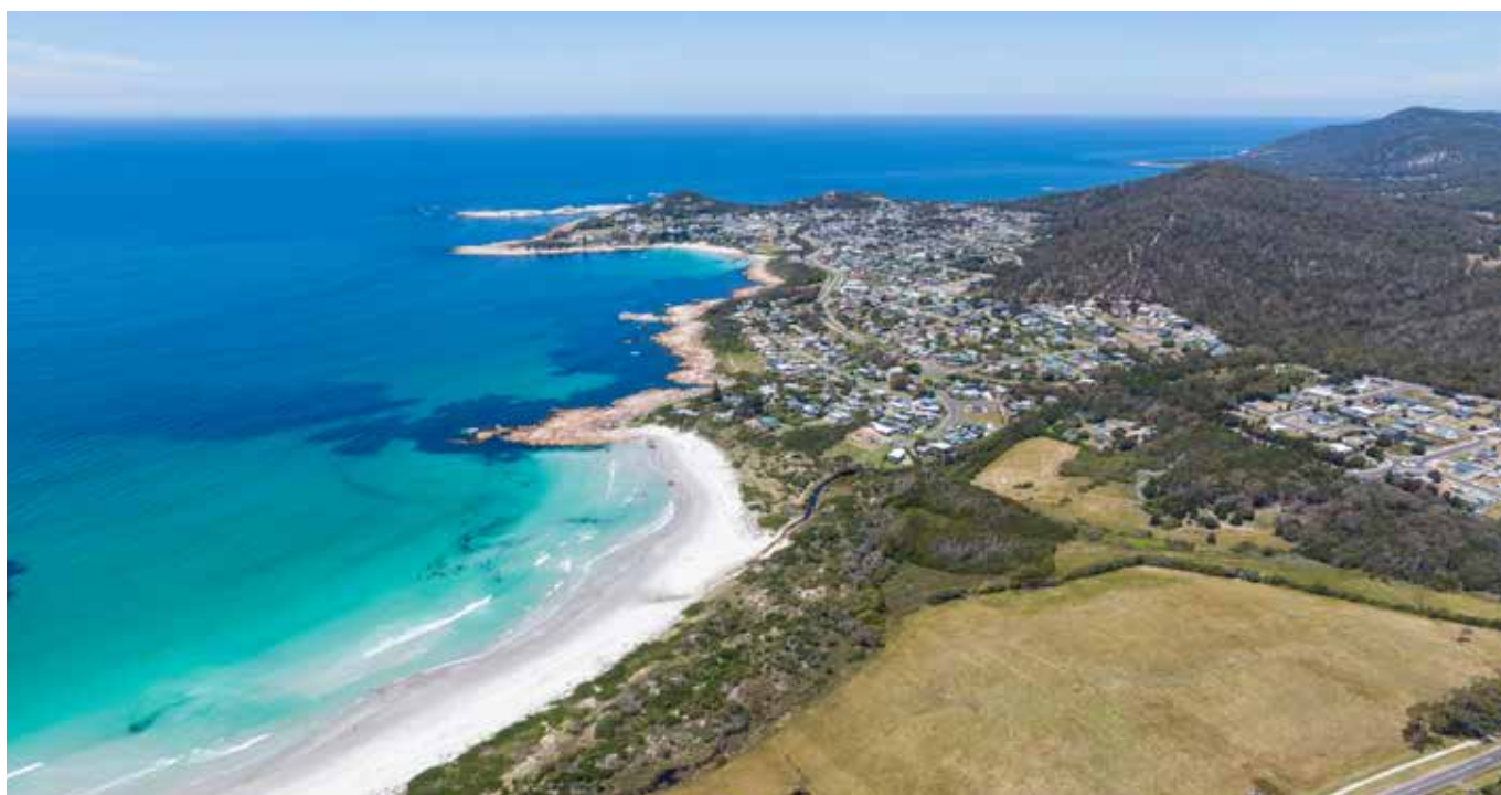
Aerial of Bicheno area

Over the coming months, Greg is planning to visit community groups and attend local events to connect with as many residents as possible.