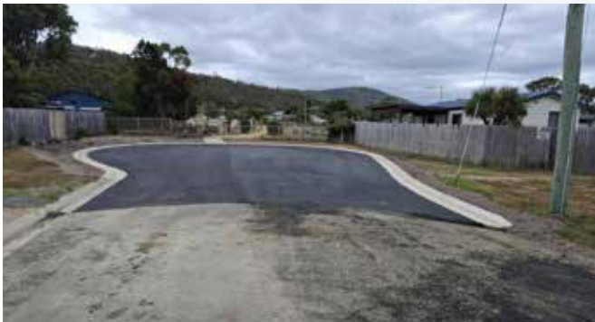
Morrison Street cul-de-sac, Bicheno