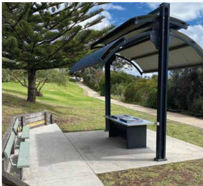
Accessible double BBQ installed at Jubilee Park

A new accessible BBQ has been installed, and the existing BBQ has been relocated under shelter for continued use.