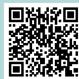
Scan this QR Code for Council's YouTube Channel.