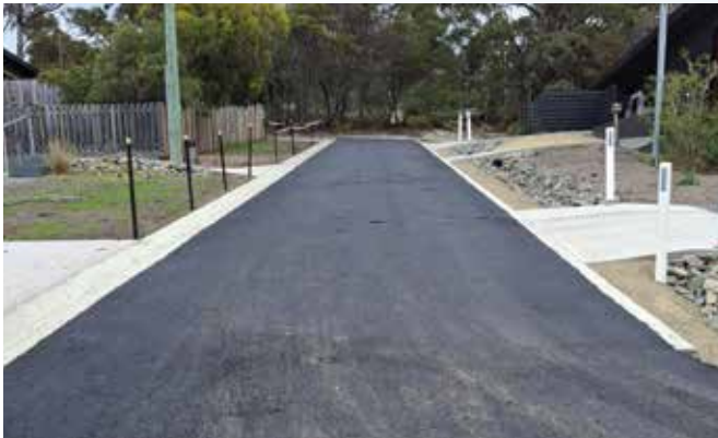
Nailer Avenue, Bicheno

Work is underway on several key roads across the municipality, including kerb and channel installations, asphaltting, and drainage upgrades on Nailer Avenue, Bicheno, and a cul-de-sac upgrade on Morrison Street, Bicheno. Gravel resheeting is progressing on Woodsden Road and Sand River Road in Buckland, Okehampton Road in Triabunna, and Flacks Road in Coles Bay, helping to maintain safe and reliable travel for residents and visitors.