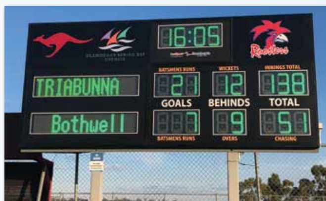
Triabunna Score Board, 1 May 2021