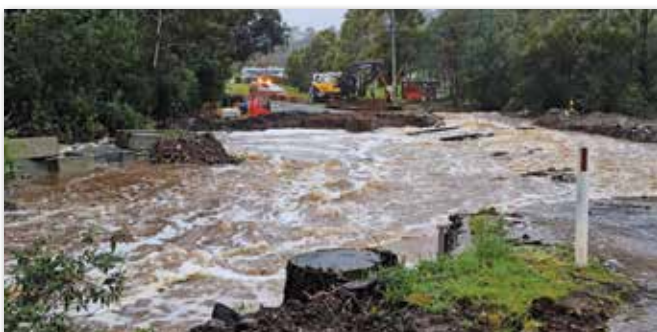
Temporary Bridge washed away, 2020

The project significantly improves the delivery of high-volume storm water flows under Rheban Road with a widened flow path and contoured rivulet channels to reduce the likelihood of floodwaters breaching the road. Footpaths for pedestrians and bollards for driver safety complete a well landscaped project which enhances the streetscape.