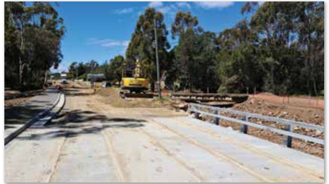
Orford Rivulet Bridge – Reconstruction underway, 2020