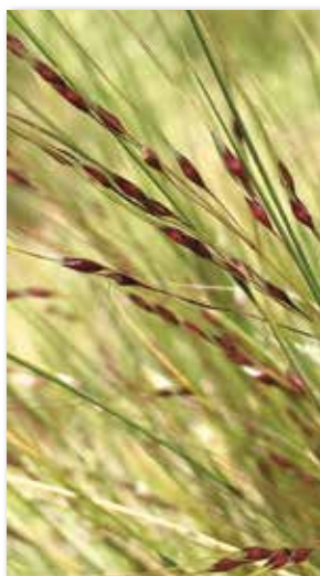
Serrated Tussock closeup