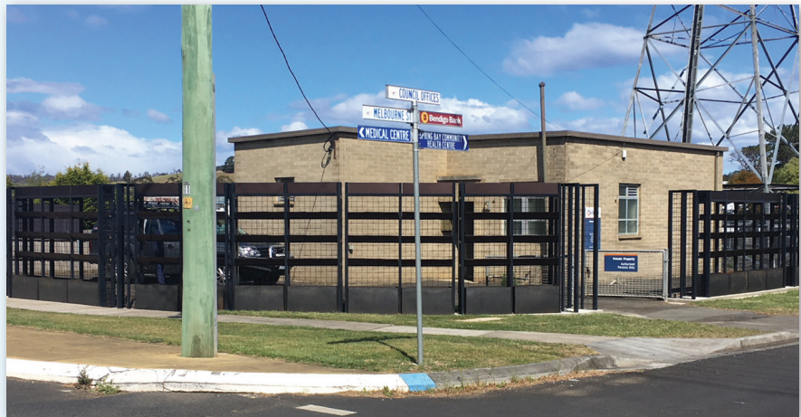
Triabunna vertical gardens structure ready for planting

The Spring Bay Harbour expansion and Triabunna Port channel straightening plans are being