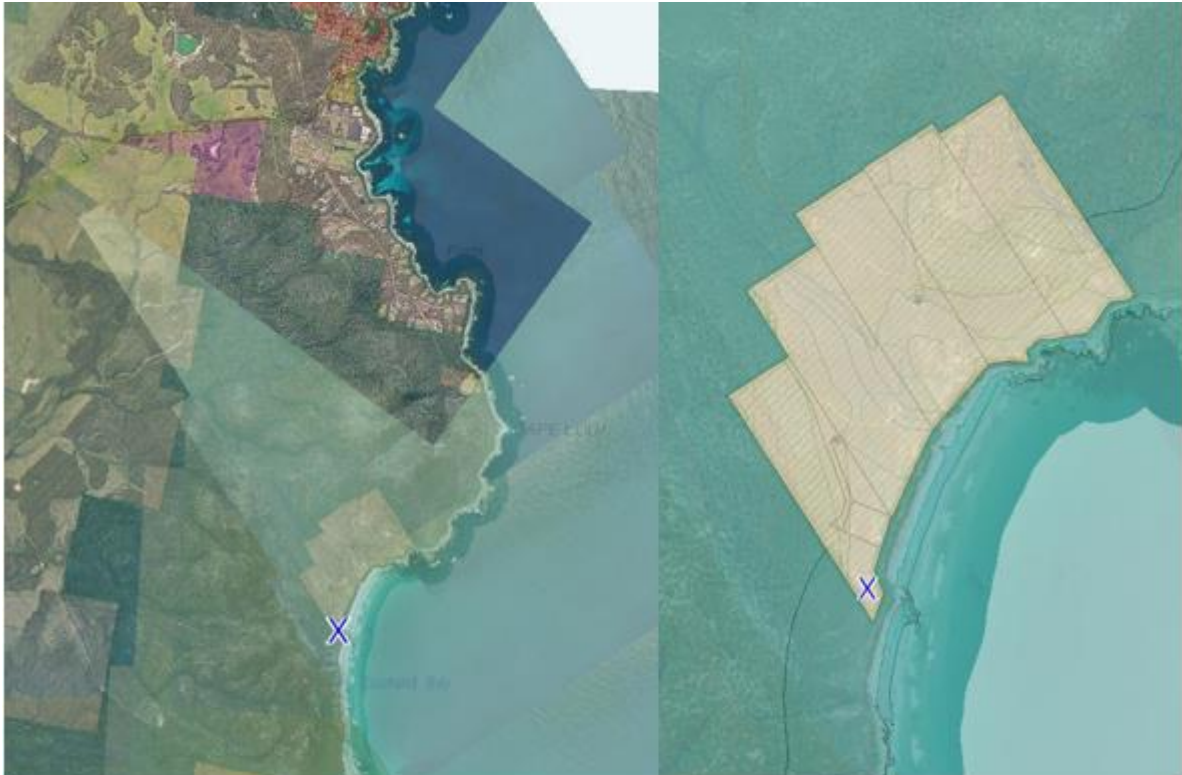
Image 1 - Site and locality where X is the development site. The left image shows the relationship with Bicheno, and the right shows the relationship with Rural zoned land surrounded by the Freycinet National Park.

The site is a Rural parcel of land with an existing Visitor Accommodation building. The site is quite remote, though is part of a conglomeration of development within proximity to other rural land. The land otherwise is bound by the Freycinet National Park. The site is accessible from the southern end of Harveys Farm Road along what is known as Courland Bay Road, which traverses the National Park.