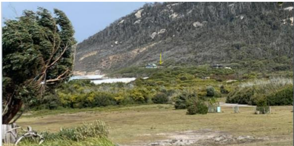
Image 2-View of site from an adjoining property.