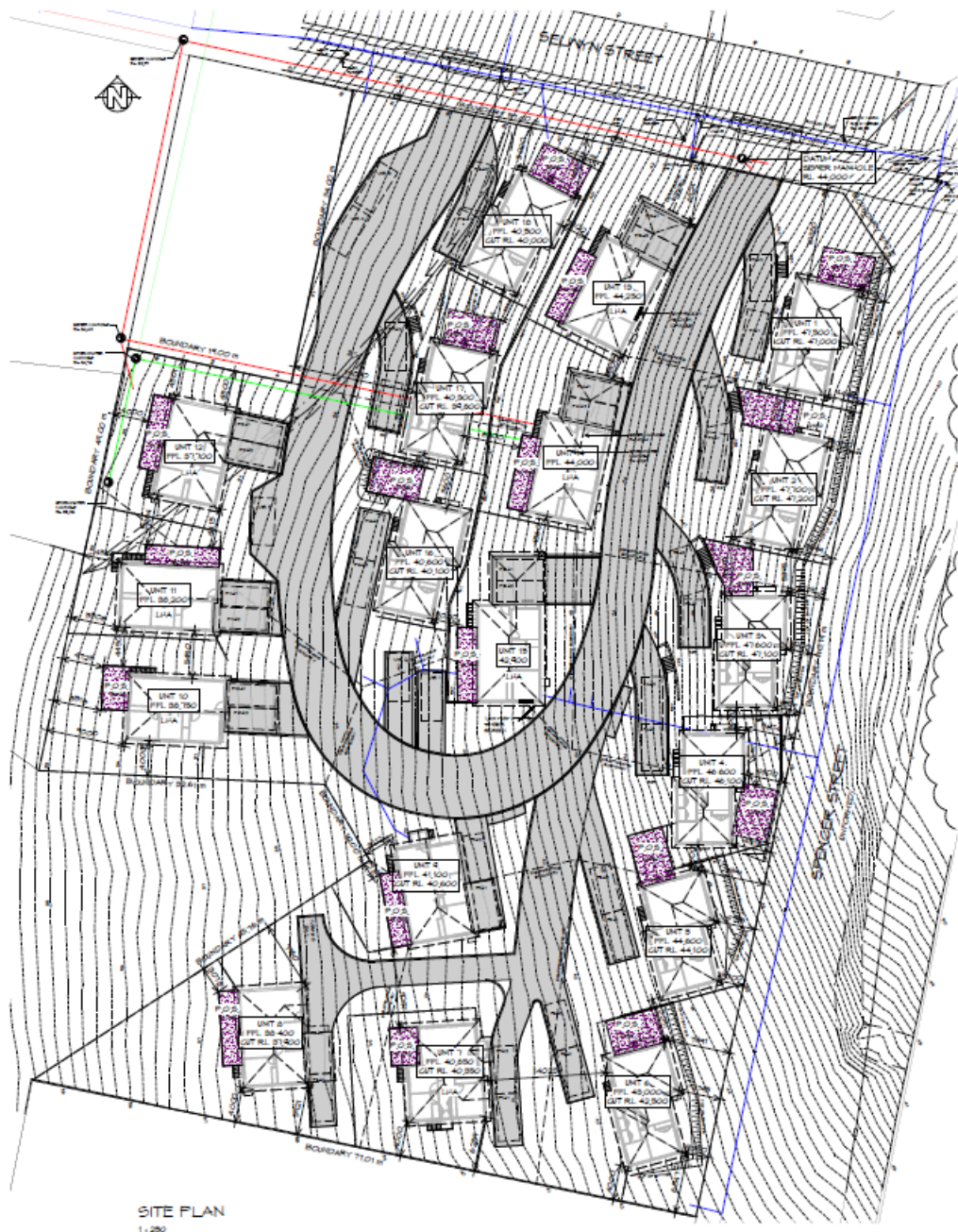
Figure 1 - Extract of Site Plan