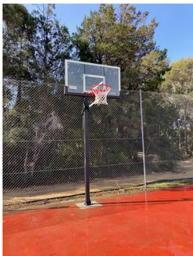
Basketball Hoop installed at the Coles Bay Tennis Courts

The new extension will replace the existing building, adjacent to the Coles Bay Hall, identified for replacement under the Asset Management Plans.