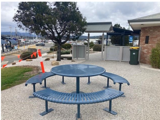
Work to improve the visitor's waiting area at the Triabunna Port is complete.