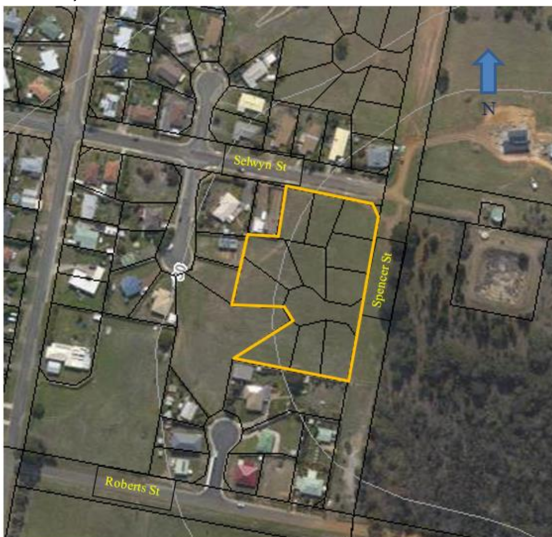
Figure 2 – Site and locality

The subject site is located on the western side of Spencer Street (unformed) and the southern side of Selwyn Street. The site is bound by residential development on all sides except to the east which is undeveloped land zoned Rural Resource under the interim planning scheme (Figure 2). The site is cleared of all vegetation except for a grass cover. The land slopes relatively steeply from east to west with a fall of approximately 14m from Spencer Street (unformed) to the adjoining lots to the west of the subject site.