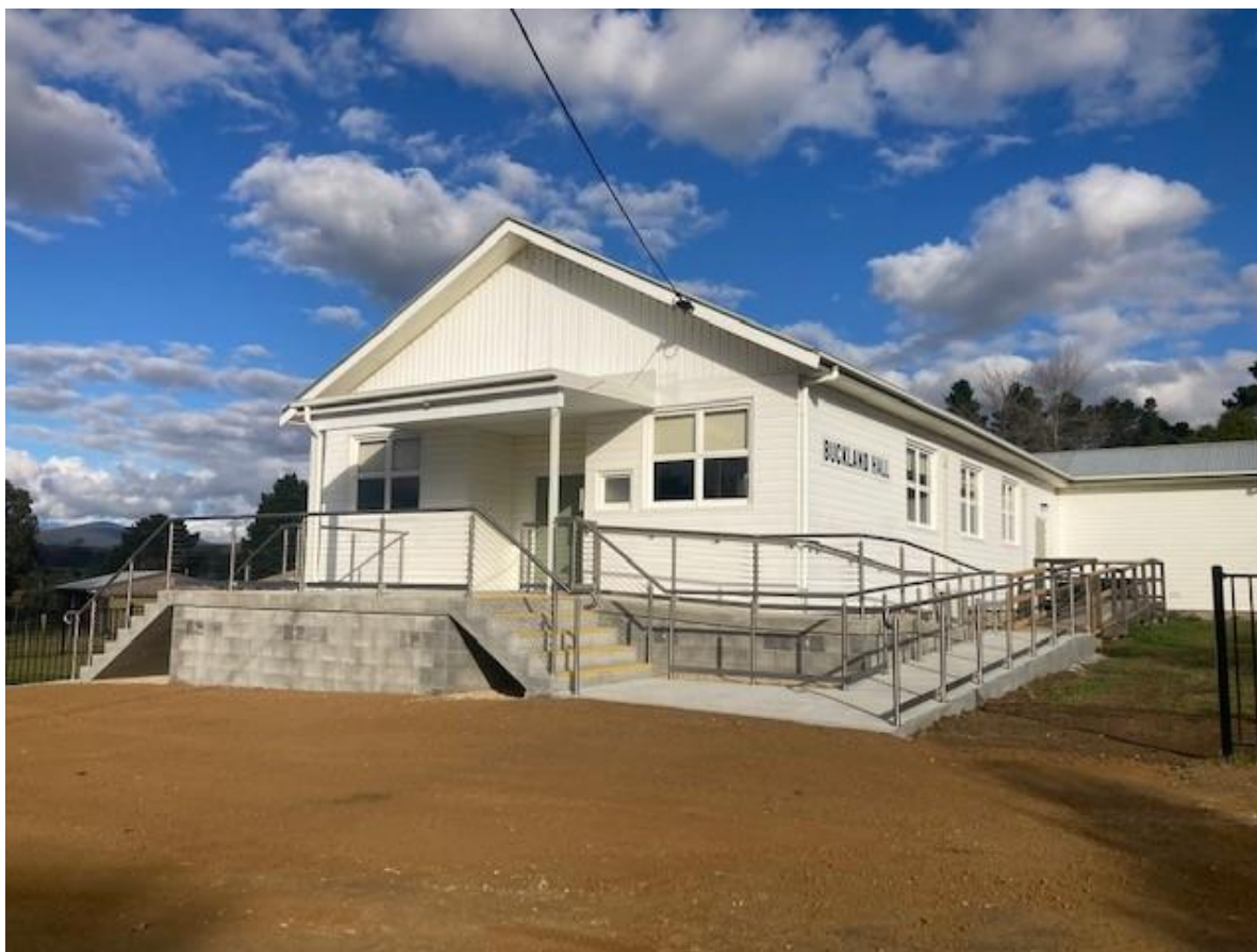
Buckland Hall Front Entrance