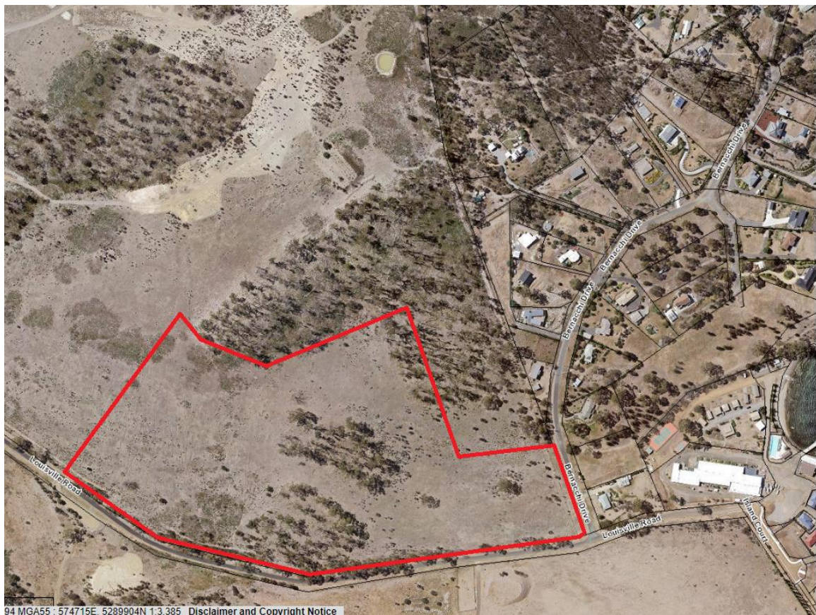
Figure 2 – Subdivision area outlined in red. (LISTmap)