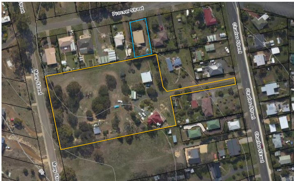
Figure 2 – 46 Charles Street, Orford outlined in orange. Lot subject to the proposed stormwater drainage easement outlined in blue (LISTmap)