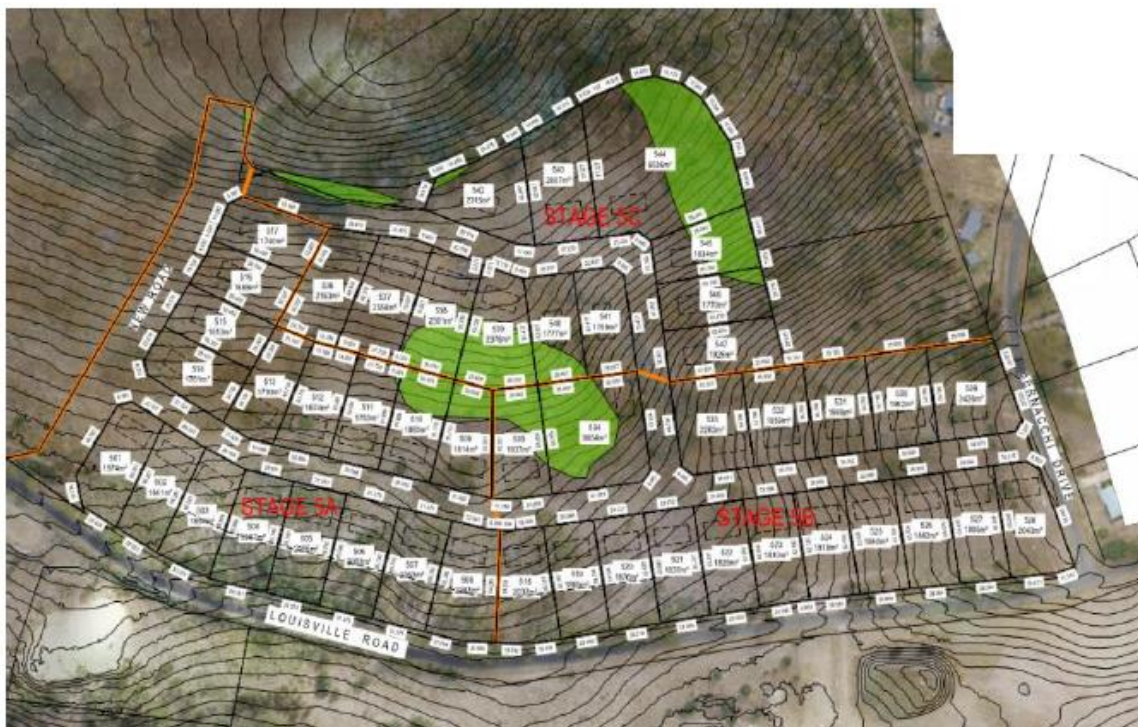
Figure 3 – Subdivision stage 5 lot plan