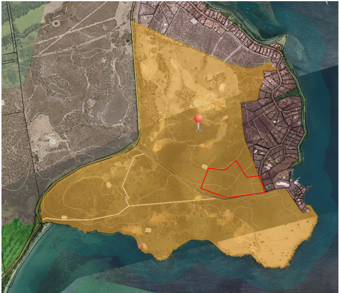
Figure 1 – Overall site, subdivision area outlined in red, Orford (LISTmap)