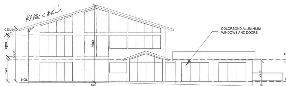
Figure 4: the northern elevation of the approved dwelling. The single storey section is 4m from the foreshore walking track and the double-storey section is 10m from the track.

The northern elevation of the approved dwelling is shown in Figure 4 below, and shows the approved dwelling's single and double storey sections. The single storey section of the approved dwelling is 4m from the northern boundary and foreshore land and the double-storey section is 10m from the northern boundary and foreshore walking track. Along that walking track there is a remaining fringe of native vegetation.