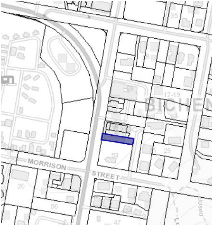
Figure 4 – location plan