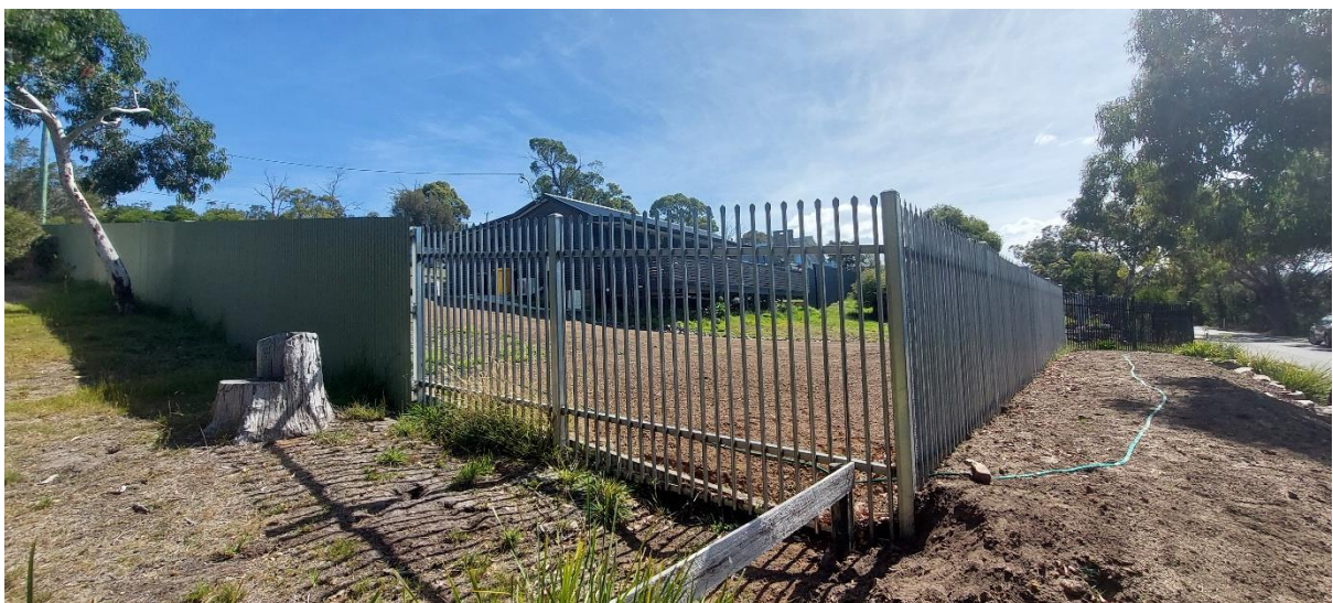
Figure 5 – View of side fence adjoining 58 Barton Ave.