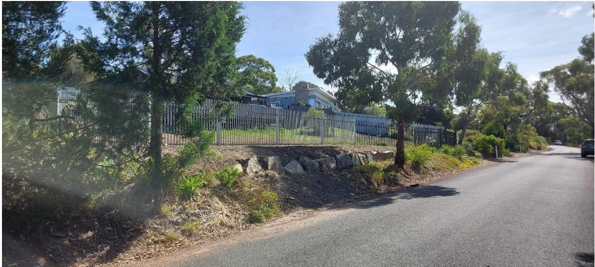
Figure 3 – Looking northwest towards Tasman Hwy