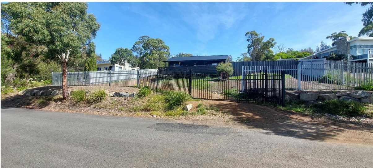
Figure 2 – Front fence