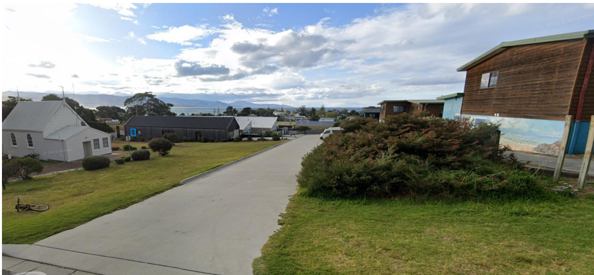
Figure 2 – the view of the building from Morrisson Street with the window where the sign will be circled in blue.