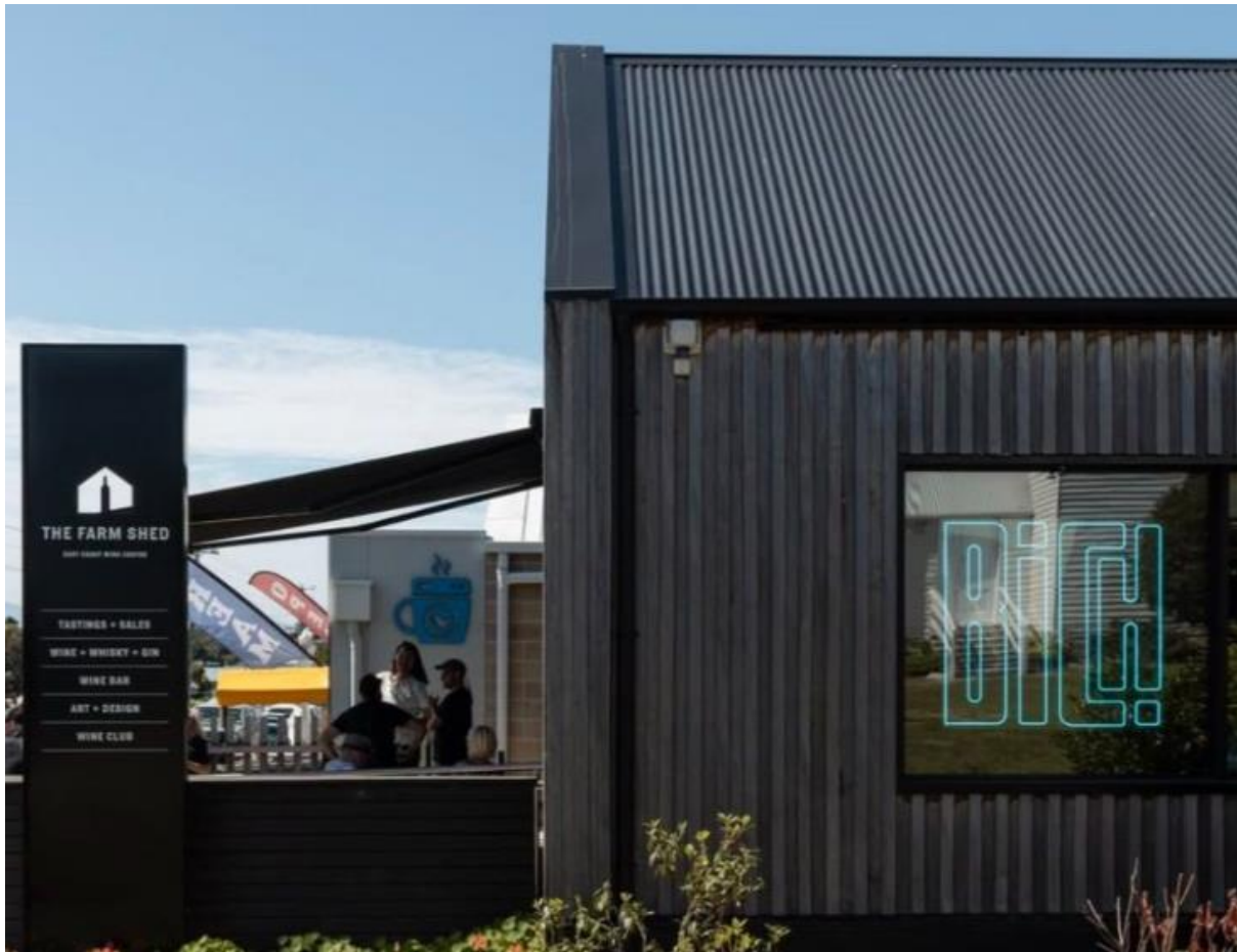
Figure 1 – the illuminated sign in the window