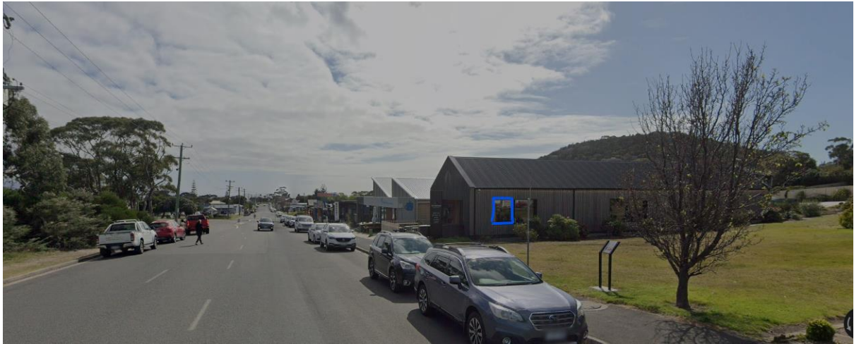
Figure 3 – the view of the building from Burgess Street with the window where the sign will be in blue.