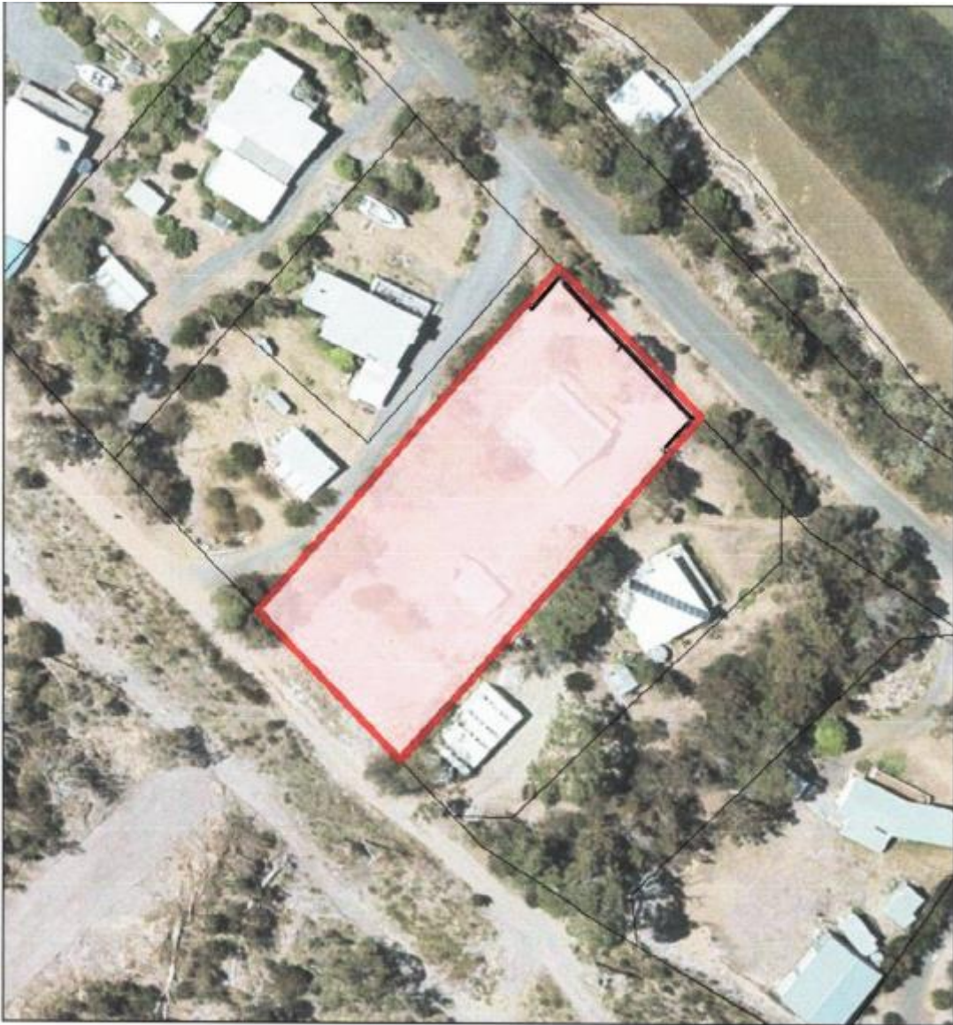
Figure 1 – Site plan showing approximate location of front fence, noting the fence is not located inside the boundaries as indicated on the plan.