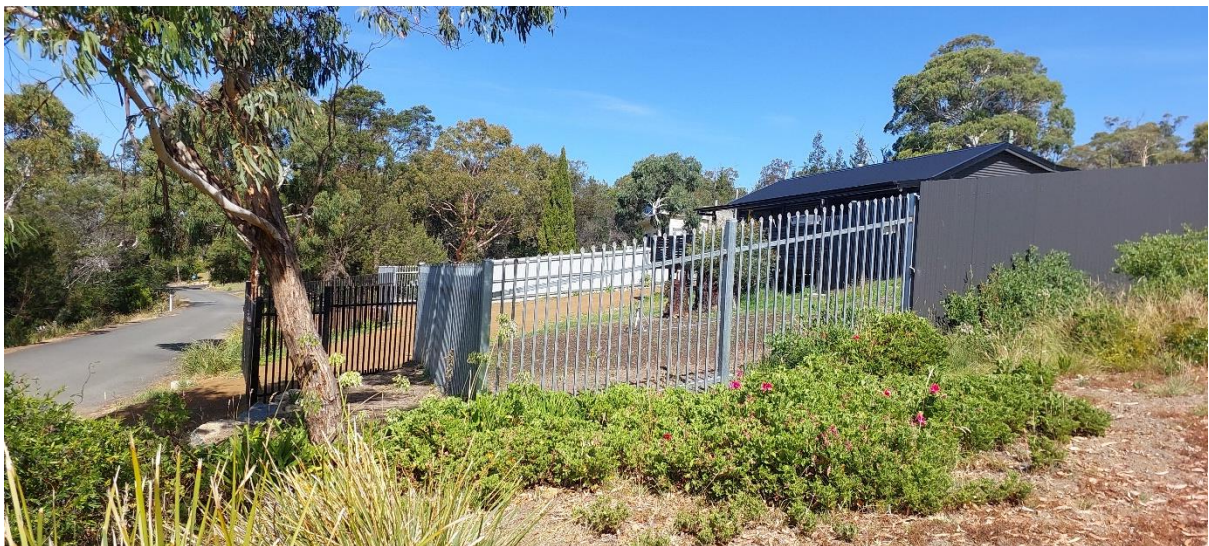
Figure 4 – View of side fence adjoining 54 Barton Ave