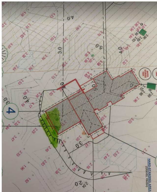
Image 1. (left) denoting the greatest area <3m AHD to be filled, contributing to the height of the eastern section of the dwelling.

The position of Council as provided to the Tribunal in a filed statement of facts and contentions (Appendix 5) is that the proposal, subject to conditions is compliant, and the conditions are reasonable. Notwithstanding this, it is reasonable that the conditions may be obviated where other design solutions are found. Further, relating to ground level, it is understood better (by virtue of having attended site), that the depression to be filled is limited to the eastern section (see image).