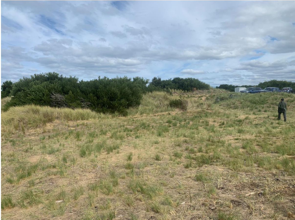
Image 3. Site area as viewable from the adjacent walkway. Note the unvegetated section is proposed to be landscaped with coastal Tea Tree, which may grow to a height of 4m.

For clause 34.4.1 (P1) (c), where amenity is understood to be the enjoyment drawn from the use of the land, it is considered relevant for the users of the walkway that a sense of being within nature contributes to the amenity, and excepting the adjacent dwelling at 638 Dolphin Sands Road, to walk this land is otherwise devoid of man-made structures and relatively closed in by vegetation. Therefore, the inclusion of landscaping will assist in perpetuating the degree of amenity drawn from the use of the walkway, irrespective of any perchance glimpse of the dwelling.