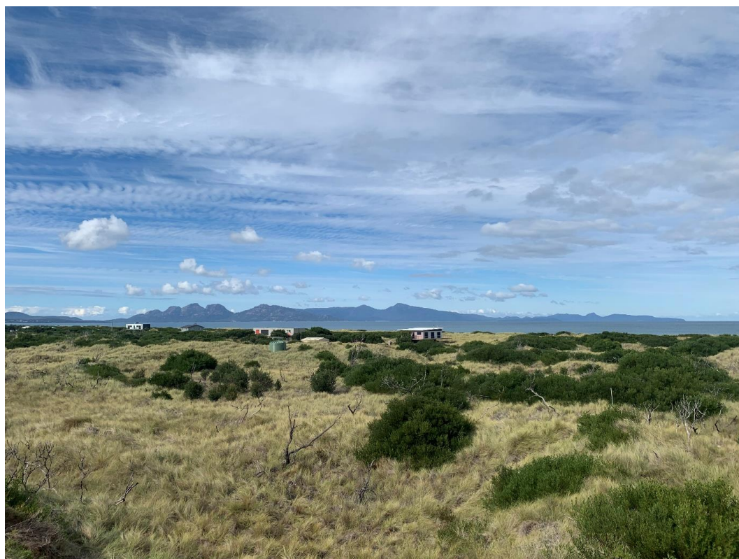
Image 2. Existing developments as viewable from 638 Dolphin Sands Road.

With regard to the amended plans, for (a), (b) and (c), it is appreciated the landscape is defined by undulating dunes, moderate vegetation, established views toward the South, and Single Dwellings on large lots. These are accepted in the Dolphin Sands area despite their varying degrees of visibility. With regard to (d), the provision of further screening vegetation will serve to integrate the development into the surrounds, and will offer moderate screening. Largely the vegetation assists where that walkway otherwise traverses an open grassed area which affords a clear view of the bulk of the dwelling. With respect to the appellant who owns the site adjacent to the walkway, there are clearly viewable dwellings on a number of allotments and the development of a further dwelling is not considered alien. Further, as the iconic view is to the south east (Hazards and Freycinet), the degree to which the development imposes on a sensitive view (see (f)) is considered tolerable, in that it serves more to detract from rather intrude upon the more iconic view (see image 2), and the degree to which it detracts is not unreasonable in appreciating the landscape as it exists.