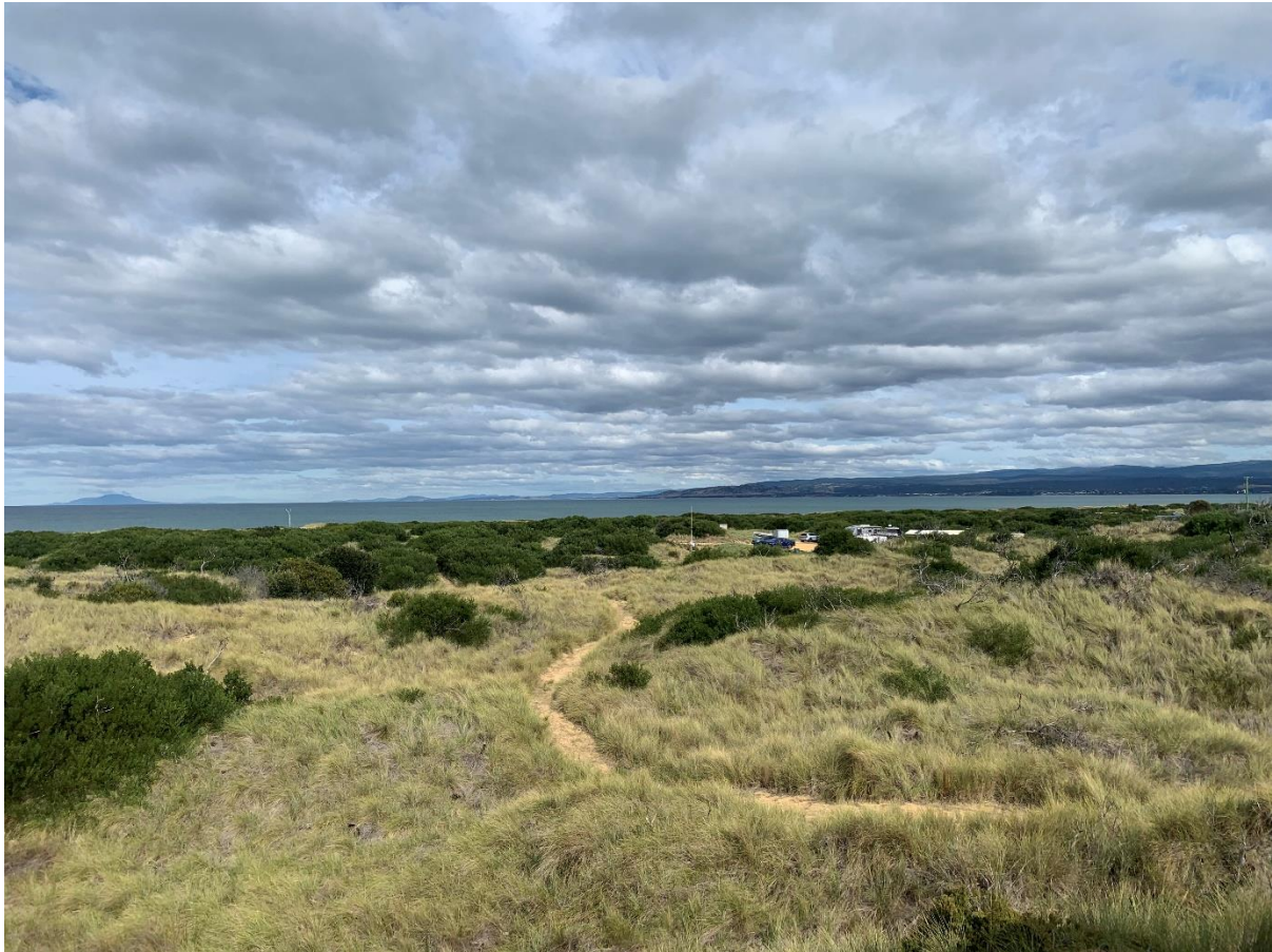
Image 4. Subject site as viewable from 638 Dolphin Sands Road. Note use of a 9.5m pole to identify the ridge height.