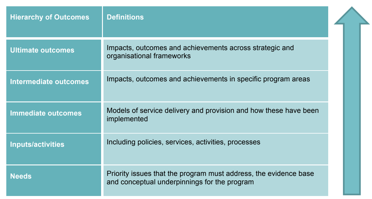
FIGURE 2 OUTCOMES HIERARCHY

In program logic, the monitoring and evaluation approach can be defined by an outcomes hierarchy using the structure outlined in Figure 2.