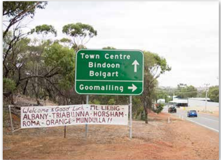
Welcome sign at the entrance Toodyay WA, 2016

Whilst our community is always very friendly and