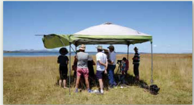
Bird watching at Moulting Lagoon

A collaborative effort is required in order to make this annual event possible at Moulting Lagoon. Thanks to our other event partners – Brown Brothers Devils