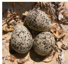
Hooded Plover Eggs

Glamorgan Spring Bay beaches are well known by bird lovers to be havens for Hoodies!