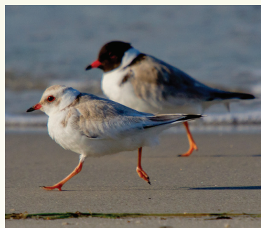
Hooded Plover adult & juvenile by Alan Fletcher